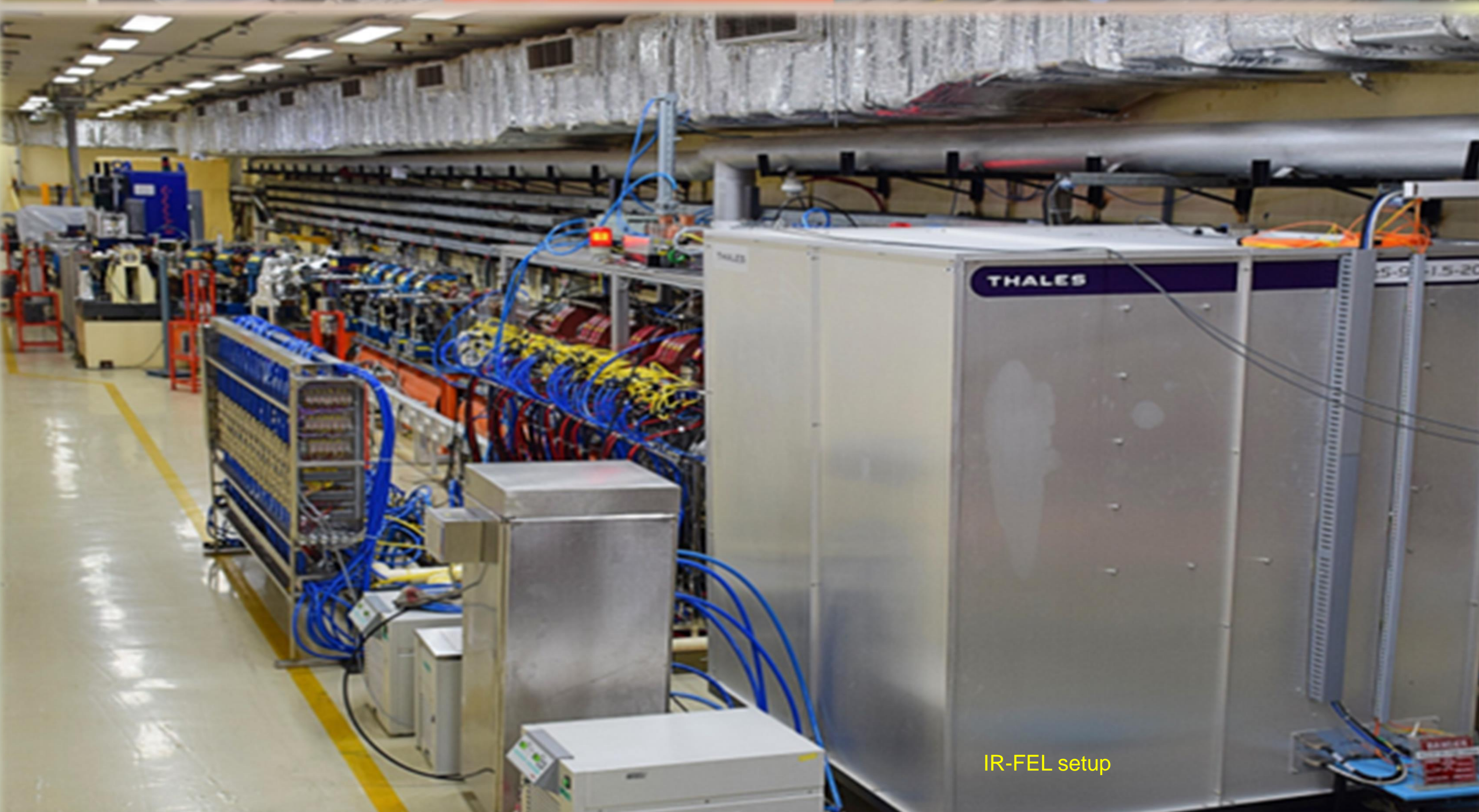
10 MeV Electron LINAC